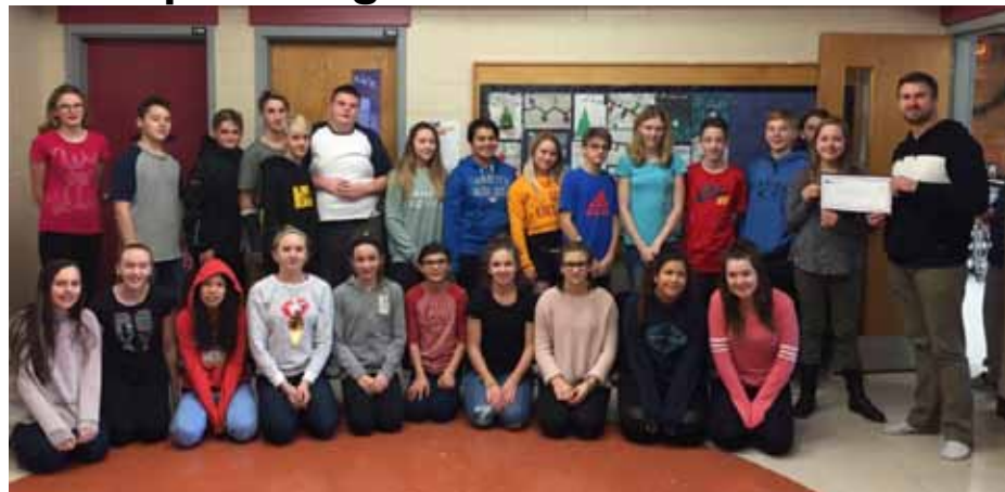
Grade 7/8 students in Pilot Butte

“This was so terrific – seeing children and youth fundraise to help other children was amazing,