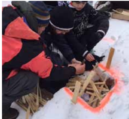
Fire building competition