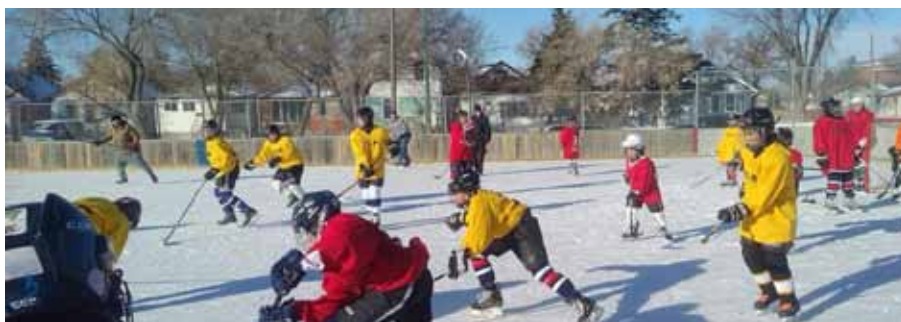
Players at Grassick Rink

“This experience has rejuvenated my love for the game because these kids are there because they want to be there and they love hockey.”