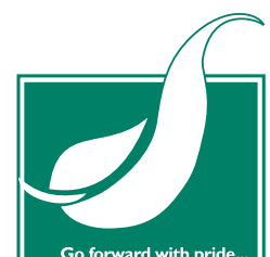
Ranch Ehrlo Society