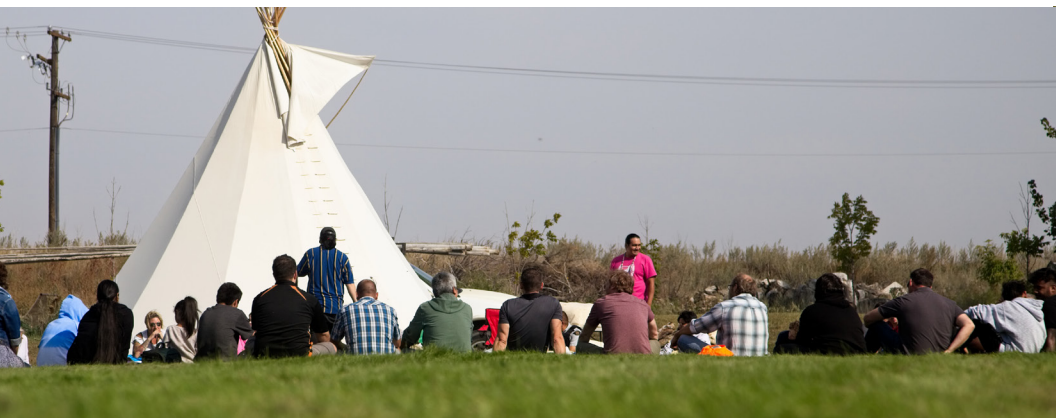
Pilot Butte campus

We would like to acknowledge that our campuses are on the traditional lands, referred to as Treaty 4 and Treaty 6 Territories and the homeland of the Métis Nation. We pay our respect to the First Nations and Métis ancestors of these places and reaffirm our relationship with one another.