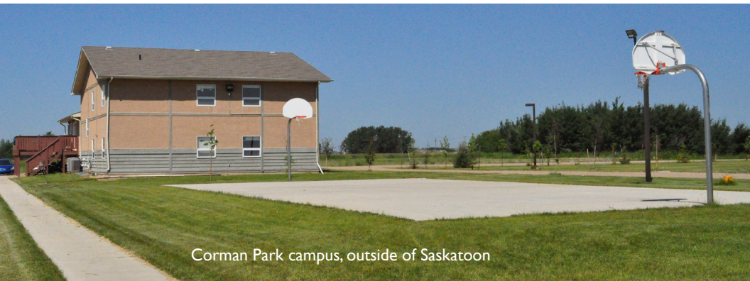
Corman Park campus, outside of Saskatoon

We envision communities where all individuals and families achieve their full potential.