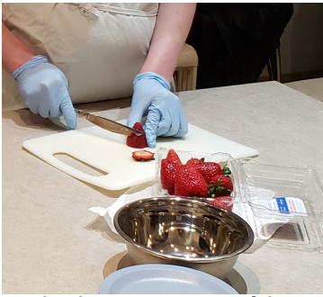
lunch program at one of the vocational programs

Many participants have had trouble in school before coming to the Ranch. We know that everyone learns in different ways. Our teachers are trained to find out the best way for everyone to learn.