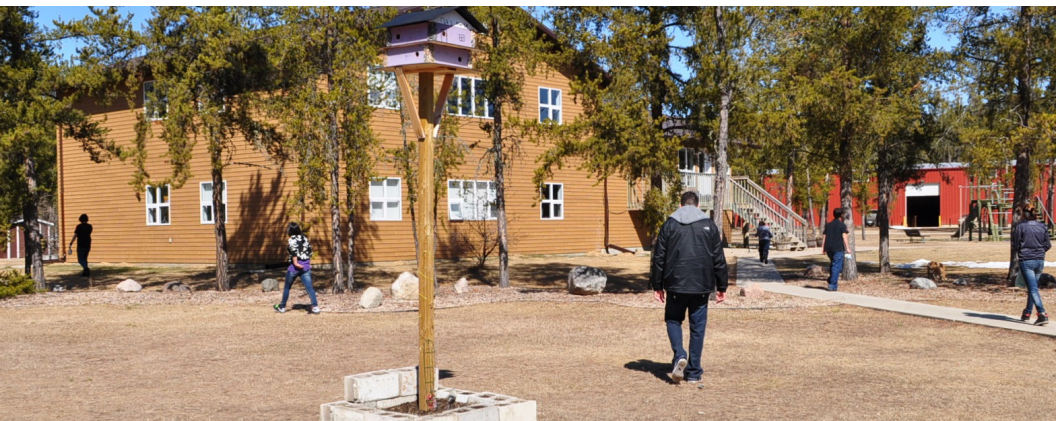
Buckland campus, outside of Prince Albert

Our main telephone number is 306-781-1800. Please feel free to call us, as we want to hear from you. Our office hours are Monday to Friday from 8:30 a.m. to 4:30 p.m. If you call outside these hours, please leave a message and someone will call you back the next working-day. You should also have a Ranch person assigned to you at intake. We encourage you to reach out to that person when ever you have questions. We also encourage you to share your ideas, thoughts, and feedback.