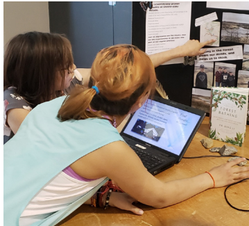
science fair at Schaller school

Your family member will be evaluated at one of the Ranch's education facilities where an Individualized Education Plan (IEP) will be developed just for him or her. We have found that an IEP greatly increases the chances for success at school because the plan is made with your family member's strengths and weaknesses in mind.