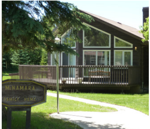
Our family house, McNamara

Holiday and weekend visits are arranged throughout the year, depending upon the location of your home and other family considerations. If you live too far away for your family member to visit on a regular basis, we can work together to find other relatives or family members within the local area, and arrange for your family member to have visits with them. We encourage you to call ahead to let us know they will be coming; we can then make sure your family member will be home, since many of our activities occur within the community.