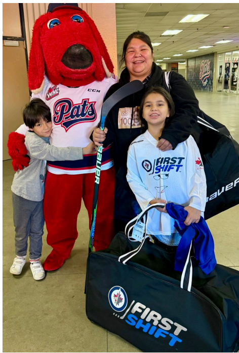
OHL family and First Shift recipient

thanks to a powerful collaboration between Ehrlo Sport Venture (ESV), OneHoop, and a team of community-minded partners. On November 1, dozens of families converged on the Brandt Centre as the NHL First Shift Program dressed players from head to toe – gifting the children equipment and giving them the pride of calling it their own.