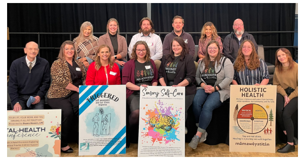
Conference planning committee

OneHoop is dedicated to supporting and strengthening relationships between Indigenous communities, governments, and the corporate sector and works to advance reconciliation across Canada. Together with OneHoop, community partners and supporters, this initiative advances ESV’s shared commitment to creating spaces where children can learn, play, and grow through sport.