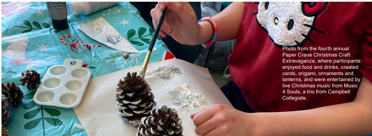
Photo from the fourth annual Paper Crane Christmas Craft Extravaganza, where participants enjoyed food and drinks, created cards, origami, ornaments and lanterns, and were entertained by live Christmas music from Music 4 Souls, a trio from Campbell Collegiate.

Through a commitment to education, collaboration, and innovation, Ranch Ehrlo Society continues to enhance its programs