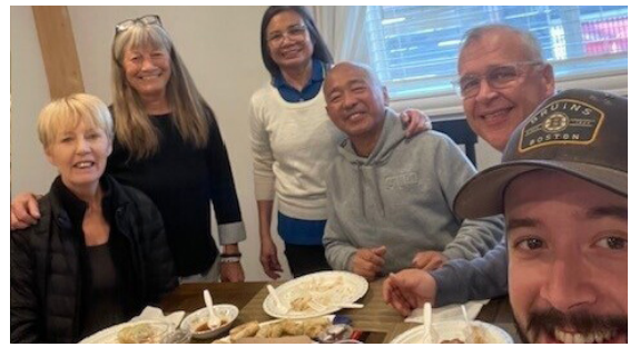
The team at Ehrlo Housing and former tenants