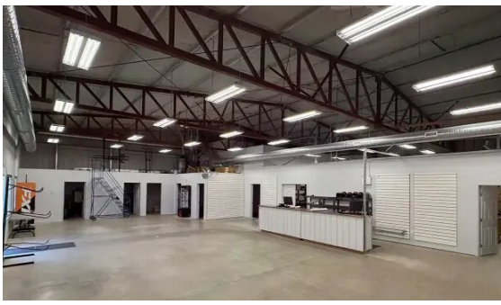
New space in Regina

people, a meeting room for six to eight, and a private office. It has already hosted team meetings and training sessions, providing staff with a central location for learning.