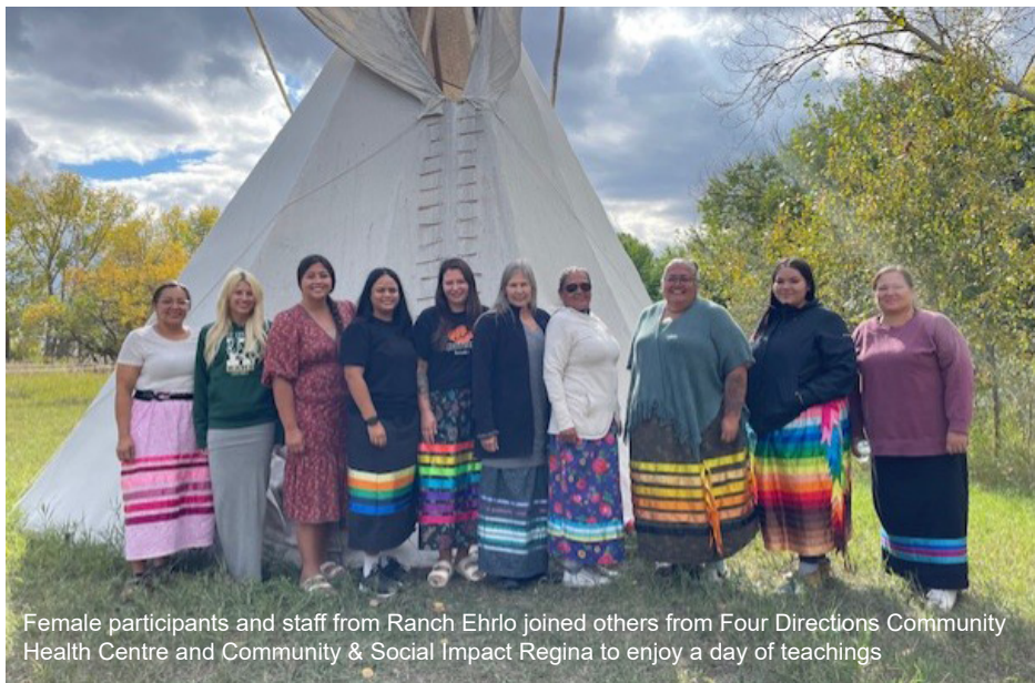
Female participants and staff from Ranch Ehrlo joined others from Four Directions Community Health Centre and Community & Social Impact Regina to enjoy a day of teachings

Details of the year's initiatives can be found